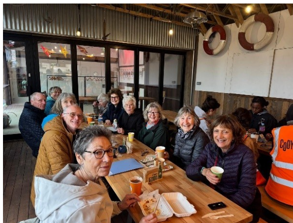
Lunch at Cody Dock