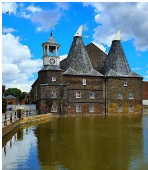
Three Mills Island