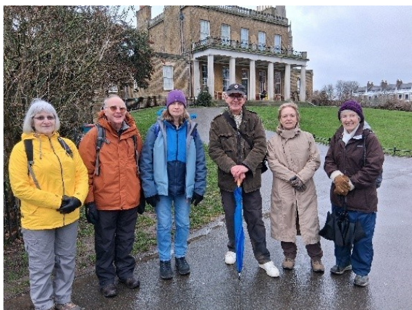
Our lunch stop in Clissold Park