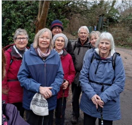
The Five Milers

Despite the sometimes inclement weather, both groups managed successful walks this month.